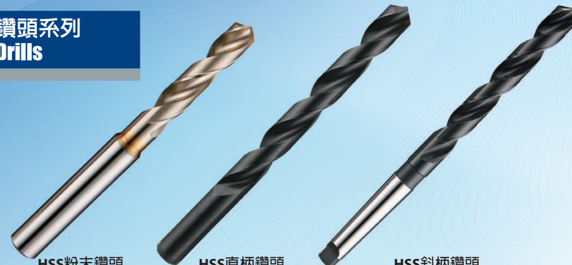
HSS粉末鑽頭 Multi Layer Coated Drills