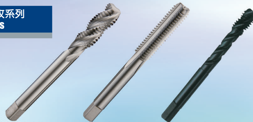
螺旋絲攻 Spiral Flute Taps