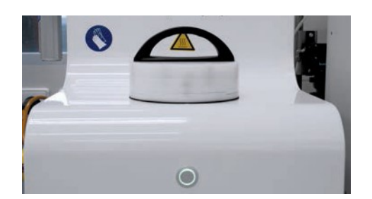
LED for easy differentiation of six modes with various colors and additional beep e.g. "drying process completed".