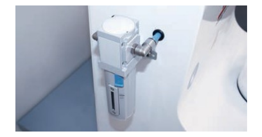
EASYMAINTENANCE and reduction of excessive moisture by a slightly emptiable collecting container.