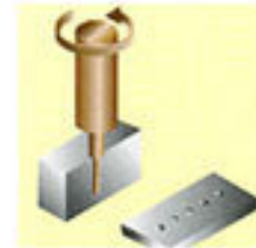
C軸旋轉加工 C-axis rotation machining