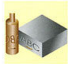
C軸齒條加工 C-axis rack machining