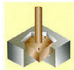
方擴孔 Square hole expansion