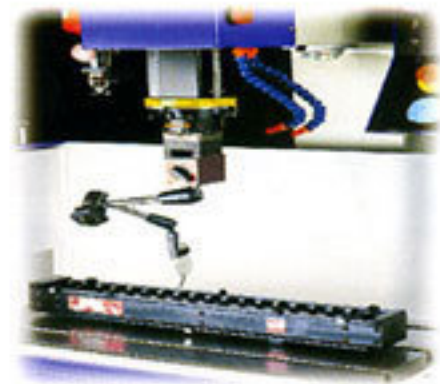
機械定位精度偏差補償 Position deviation compensation