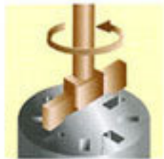
旋轉角度定位加工 C-axis rotation angle positioning machining