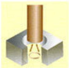
圓柱擴孔 Cylinder hole expansion