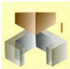
Z軸直線加工 Z-axis linear machining