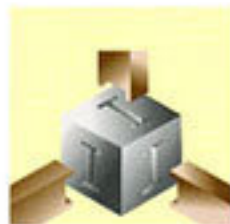
三軸直線加工 3-axis linear machining