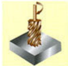
C軸螺牙加工 C-axis thread machining