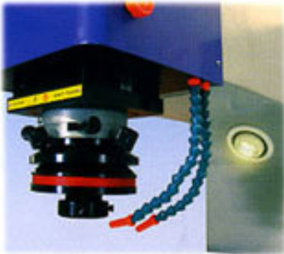
內藏式照明防火偵測系統 Hidden illuminating fire-proof sensor