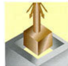
三軸同動直線加工 Simultaneously 3-axis linear machining