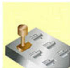
直線位移加工 Linear-move machining