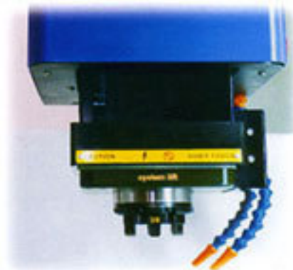
內藏式旋轉軸(C軸) Build-in rotation axis (C-axis)