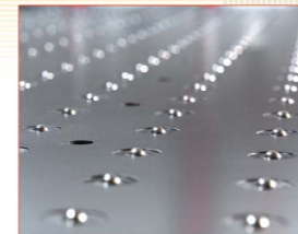
Air floating in cut area [optional]