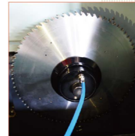
Air quick change [optional]