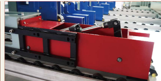
Efficiency in narrow cutting