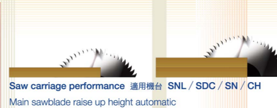
Saw carriage performance 適用機台 SNL / SDC / SN / CH Main sawblade raise up height automatic detective when met panel stack thickness