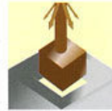
三軸同動直線加工 Simultaneously 3-axis linear machining