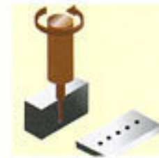
C軸旋轉加工 C-axis rotation machining