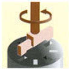
旋轉角度定位加工 C-axis rotation angle positioning machining