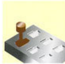
直線位移加工 Linear-move machining