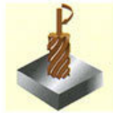
C軸螺牙加工 C-axis thread machining