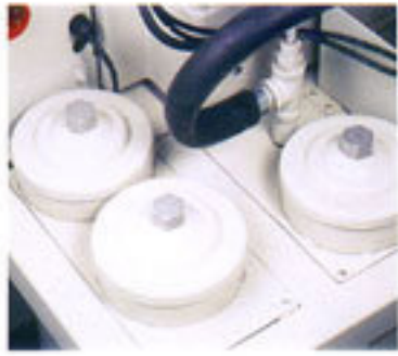
雙重過濾系統 Double filter system