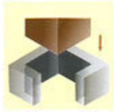
Z軸直線加工 Z-axis linear machining