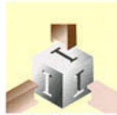
三軸直線加工 3-axis linear machining