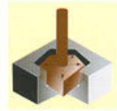
方擴孔 Square hole expansion