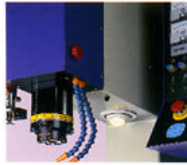
內藏式照明防火偵測系統 Hidden illuminating fire sensor