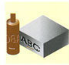
C軸齒條加工 C-axis rack machining