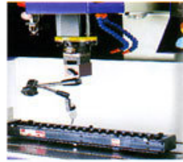
機械定位精度偏差補償 Position deviation compensation