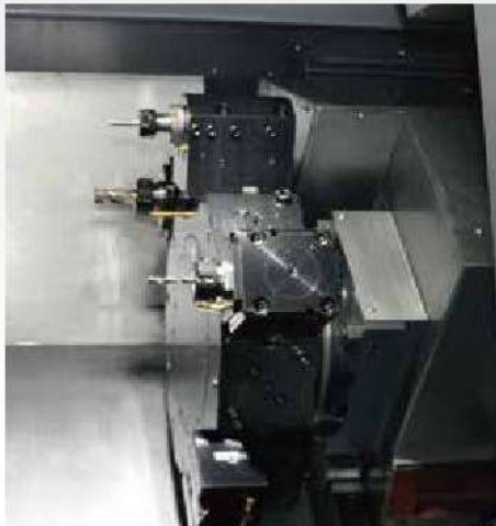
Drawing of C-axis Machining