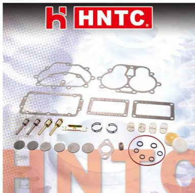
KIT, AIR COMPRESSOR 空壓機活門修理包 P112/113.310P 1108223 1300366