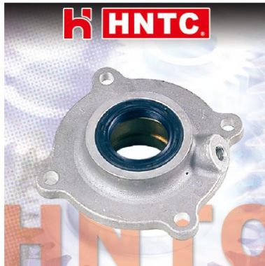
HOLDER, A/C SEAL 空壓機油封座 6D22T 6D22A ME713233