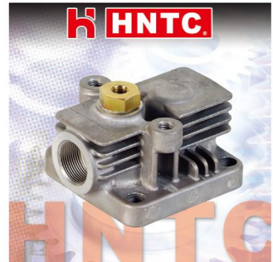
HEAD, AIR COMPRESSOR 空壓機汽缸蓋(鋁)(air cool) 6D31 6D15 6D16 6D17 ME713272 IN VALVE:ME713276 EX VALVE:ME713275