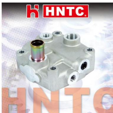
HEAD, AIR COMPRESSOR 空壓機汽缸蓋上 E13C-T 390PH 85mm 29110-1880-H