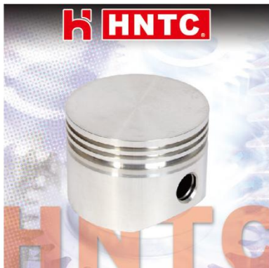
PISTON, AIR COMPRESSOR 空壓機活塞 80mm X 3Ring 8DC90. 80 30076-35201