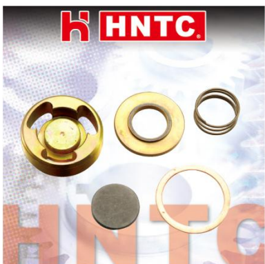
VALVE, IN A/C 進氣活門 70 H06CT*84 H07C W06 29101-1220