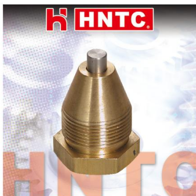
VALVE, UNLOADER 減壓活門 EK100 FP415 EP100 EM 29103-1020