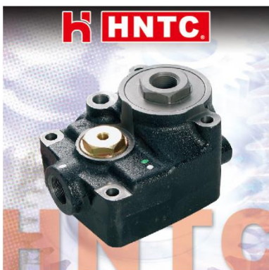
HEAD, AIR COMPRESSOR 空壓機汽缸蓋 CW520 CK450 CD450 14540-99208 H=101mm 14540-99127 H=86mm