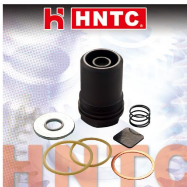
VALVE, EX A/C 排氣活門總成 P11C-TK*99 LSH2P*99 29107-1260