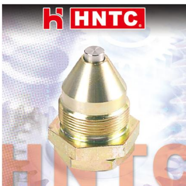
VALVE, UNLOADER 減壓活門 K13C-TE 29103-1140