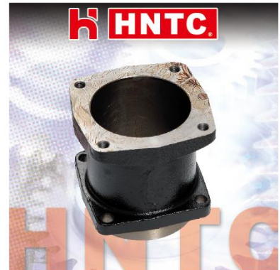
LINER, A/C 空壓機汽缸套85m/m EXR330 10PC1(330) 1-19151219-0