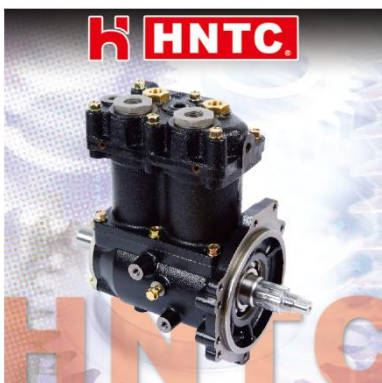
AIR COMPRESSOR A'SSY 空壓機總成P=80mm 6D24-T TRUCK 35mm W/O 1/4TP ME353930-H T=10(ME150697) 6D24-T BUS 35mm W/O 14mm ME353931-H T=10(ME151923)