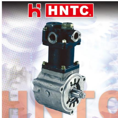
AIR COMPRESSOR ASSY 空壓機總成 EF750 85mm 29100-1840