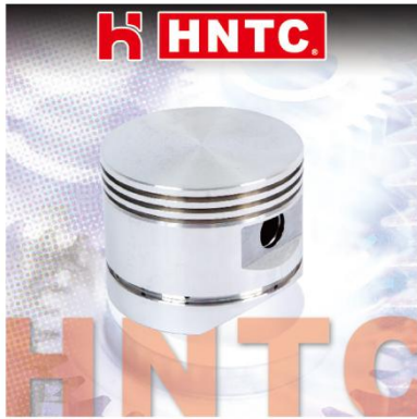
PISTON, AIR COMPRESSOR 空壓機活塞 95mm X 4Ring E13C-T 420PH 29191-1200