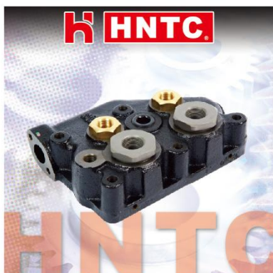
HEAD, AIR COMPRESSOR 空壓機汽缸蓋 6D24-T BUS 出水孔14mm ME737082-H