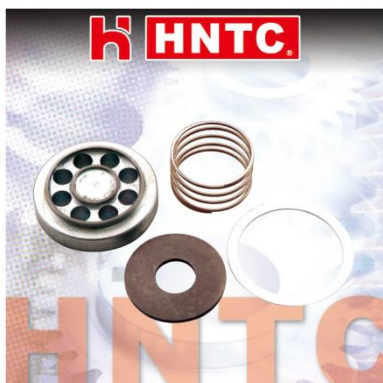
VALVE, EX A/C 排氣活門總成 FV112 8DC2.4.8.9 T33 ME048010