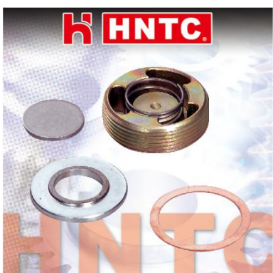
VALVE, IN A/C 進氣活門D=36*H11.5 EH700 FF RK EAK 29101-1050