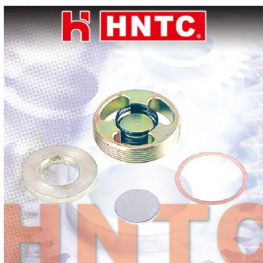
VALVE, IN A/C 進氣活門 6D22T 6D24T ME713068 30975-03080