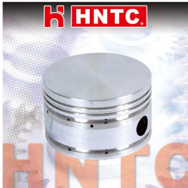
PISTON, AIR COMPRESSOR 空壓機活塞 85mm X 4Ring 6HK1 6HE1 1-19161-016-0