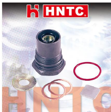
VALVE, EX A/C 排氣活門 8DC91 6D22A 8DC11 ME713032