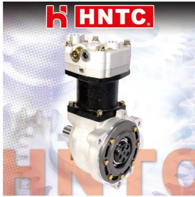
AIR COMPRESSOR A'SSY 空壓機總成P=95mm 6WF1-T 曲軸35mm 1-19100-333-5H CRANK SHAFT D=35mm

1-19100-335-1H 曲軸30mm CRANK SHAFT D=30mm