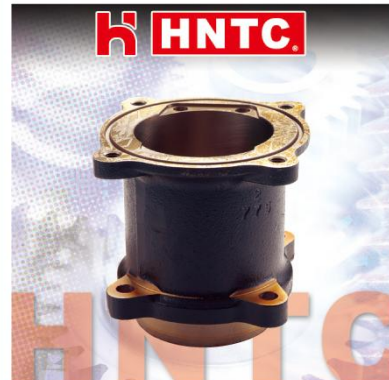
LINER, A/C 空壓機汽缸套 85mm K13C-TV 29165-1280