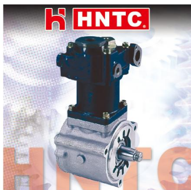
AIR COMPRESSOR ASSY 空壓機總成 F17C F20C 85mm 29100-2151