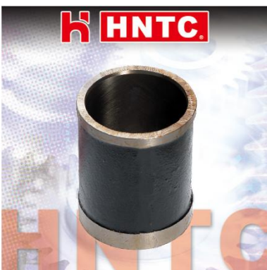
LINER, A/C 空壓機汽缸套(圓)d=70* EH700*80-88 RK 70mm 29165-1100