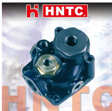
HEAD, AIR COMPRESSOR 空壓機汽缸蓋 K13C K13C-TE 29110-1536