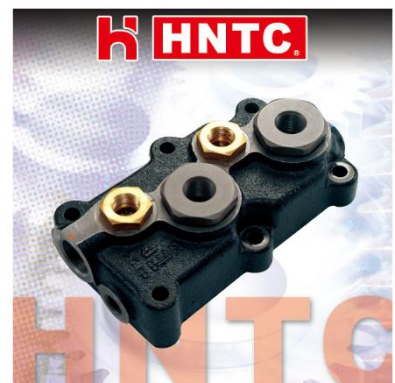
HEAD, AIR COMPRESSOR 空壓機汽缸蓋(雙缸) ERK*20 J08C*20(雙缸) 29110-1674