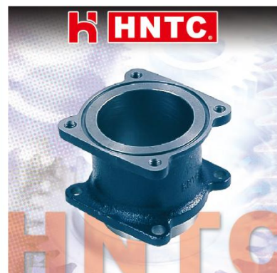
LINER, A/C 空壓機汽缸套 80m/m L:124mm 6D16T MK117 FM657 ME713203