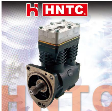
AIR COMPRESSOR ASSY 空壓機(雙缸).75m/m P114*340(無電腦)*95 1381951 LP4844 440/cm 2 12.50Bar