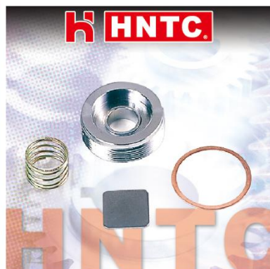
VALVE, EX A/C 排氣活門 6D15 6D16T 6D14T ME713162