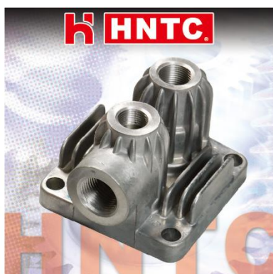
HEAD, AIR COMPRESSOR 空壓機汽缸蓋(鋁) 6BG1 FSR FTR 1-19110019-0