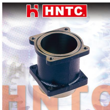
LINER, A/C 空壓機汽缸套 80m/m H07CT EK100 EM100 29165-1050