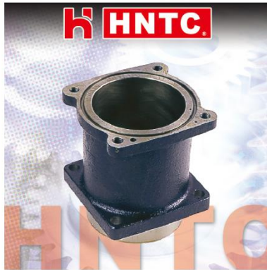
LINER, A/C 空壓機汽缸套85m/m K13C F20C F17C 29109-1010