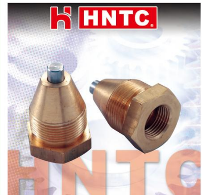
VALVE, UNLOADER 減壓活門 J08C*20"*單.雙缸 ERK 29103-1190