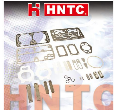
KIT, AIR COMPRESSOR 空壓機活門修理包 P114/340.360 1542159 LP4965