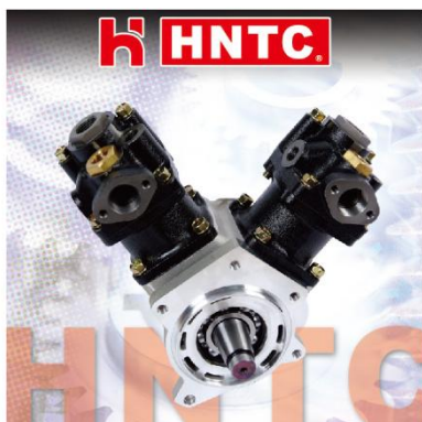
AIR COMPRESSOR A'SSY 空壓機總成P=70mm P11C LSH2P 29100-2622