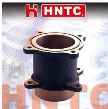
LINER, A/C (SINGLE) 空壓機汽缸套 80mm J08CT*99 單缸 29165-1220