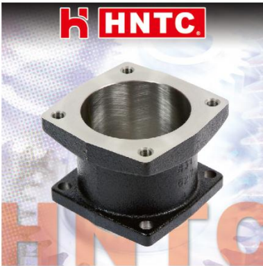
LINER, A/C 空壓機汽缸套 85m/m 6HK BUS 1-19151218-0-H