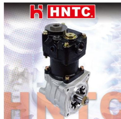
AIR COMPRESSOR A'SSY 空壓機總成P=95mm CW520 CK450 HEAD=86mm 14501-97165