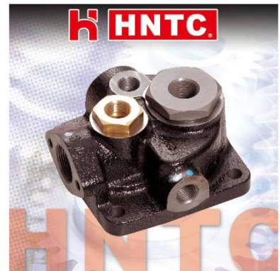
HEAD, AIR COMPRESSOR 空壓機汽缸蓋 H06CT* H07DT* FC3W MFD MGD MGH MFGIH 29110-1590