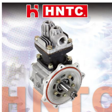
AIR COMPRESSOR ASSY 空壓機總成 6BG1(195) 6BG1T 1-19100-220-0