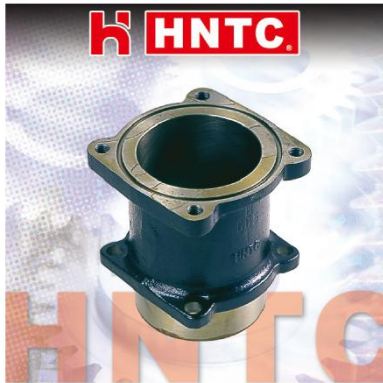
LINER, A/C 空壓機汽缸套 95m/m CW520 CK450 RF8 14535-99019