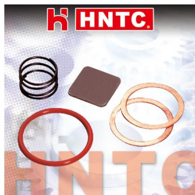
KIT, EX VALVE 排氣活門小修包 8DC91 6D22A ME713032-KIT