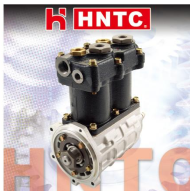
AIR COMPRESSOR ASSY 空壓機(L雙缸)總成.80m/m ERK*20 J08C*20 29100-2364 29100-2338 29100-3000 29100-3080 S2910-03011