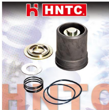
VALVE, EX A/C 排氣活門 CW520 CK450 RF8 PF6T 14569-99327 H:90m/m 14569-99326 H:75m/m