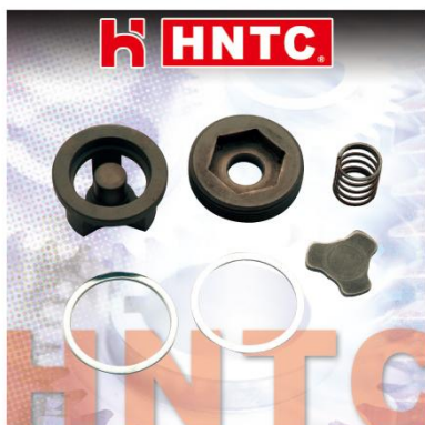
VALVE, EX A/C 排氣活門修理包 6BG1 6BG1-EX-KIT