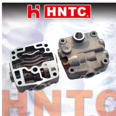
HEAD, AIR COMPRESSOR 空壓機汽缸蓋. 鋁. 上 K13C-TV*99 LSH1K*99 29110-1700