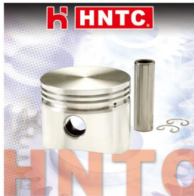
PISTON, A/C 空壓機活塞 75mm P113-320 FL10 H197493-20