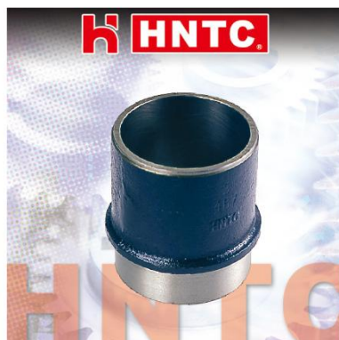
LINER, A/C 空壓機汽缸套 85m/m FV415 FV419 8DC11 ME713101