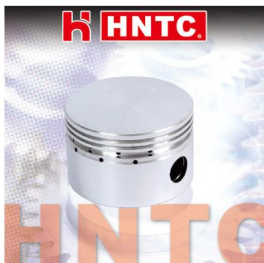
PISTON, AIR COMPRESSOR 空壓機活塞85mm X 4Ring E13C-T 390PH 29191-1220