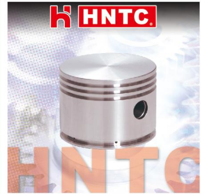
PISTON, AIR COMPRESSOR 空壓機活塞 80m/m*4 6D15 6D16 6D14 ME713143