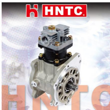
AIR COMPRESSOR A'SSY 空壓機總成P=70mm 6D15A-T 6D16A-T 6D17A-T ME077450