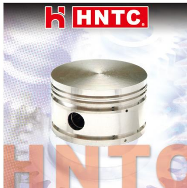
PISTON, A/C 空壓機活塞 90mm*4 10PD1 6RB1T(340) 1-19161-014-0