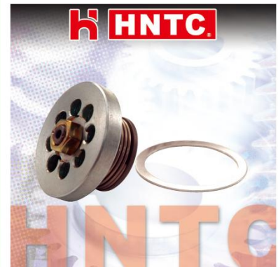
VALVE, IN A/C 進氣活門總成 FV112 8DC2.4.8.9 T33 ME067030 ME048004