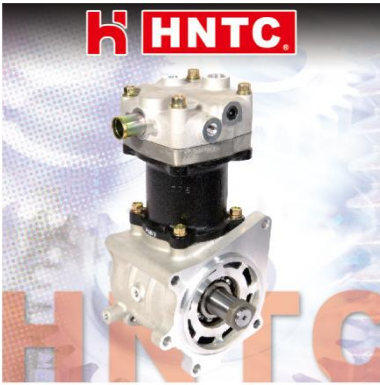
AIR COMPRESSOR A'SSY 空壓機(單缸) 鋁蓋.85mm共軌車 P11C-2004Y 29100-2971-H