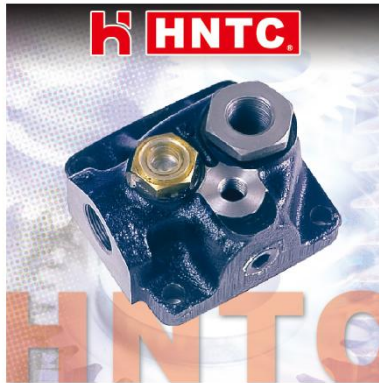
HEAD, A/C空壓機汽缸蓋 8DC91 8DC11ME713199 HEAD, A/C空壓機汽缸蓋 6D22A 6D20ME713206