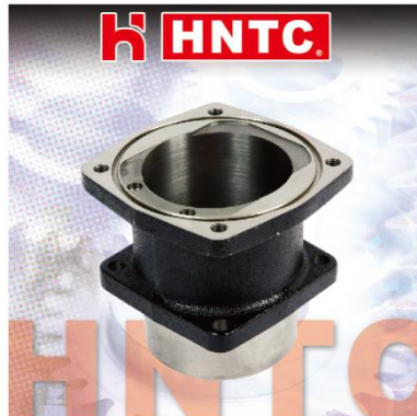
LINER, A/C 空壓機汽缸套 95m/m E13C-T 420PH 29165-1400