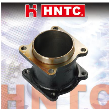
21. LINER, A/C 空壓機汽缸套 70m/m 6BG1(175) 6BD1T*86 1-19151222-0