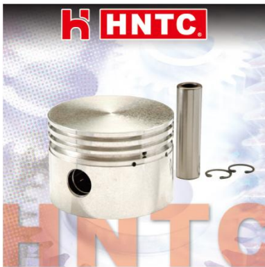
PISTON, A/C 空壓機活塞 75mm P112(310) P113(310) KS075186