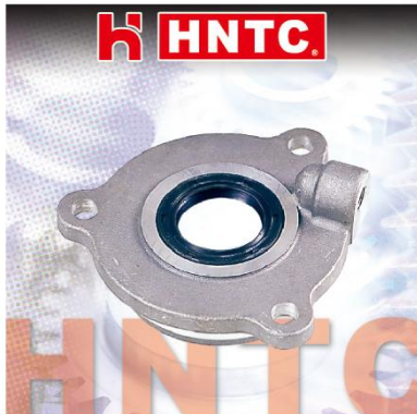
HOLDER, A/C SEAL 空壓機油封座 6D22T 6D22 ME713435