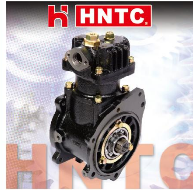
AIR COMPRESSOR A'SSY 空壓機總成(鐵殼)P=80.氣冷 6D15 6D16 6D14T ME037933-H

1-19100-335-1H 曲軸30mm CRANK SHAFT D=30mm