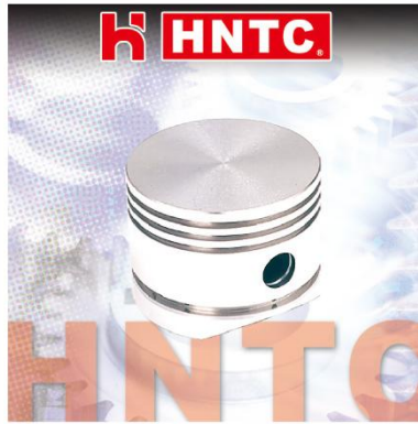
PISTON, AIR COMPRESSOR 空壓機活塞 70m/m*4 H06CT H07CT P11C-T 29191-1130