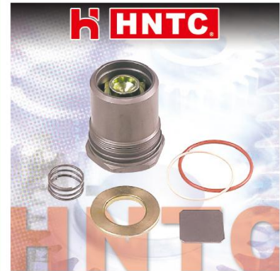
VALVE, EX A/C 排氣活門 6D22T 6D24T ME713069 30975-03090