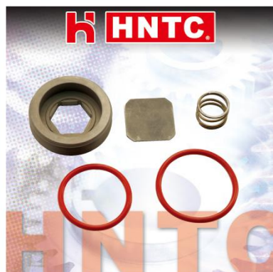
VALVE, EX A/C 排氣活門修理包 EXR330 10PC1 10PC1-EX-KIT