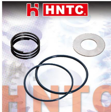
KIT, EX VALVE 排氣活門小修包 CW520 CK450 RF8 PF6T 14569-KIT