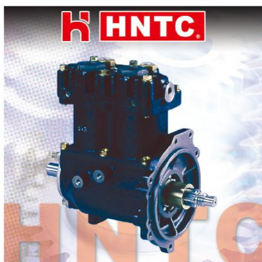
AIR COMPRESSOR ASSY 空壓機總成 6D22T MP618 25cm 12mm ME150355 T=6 6D24T FP517 30cm 12mm ME150591 T=10