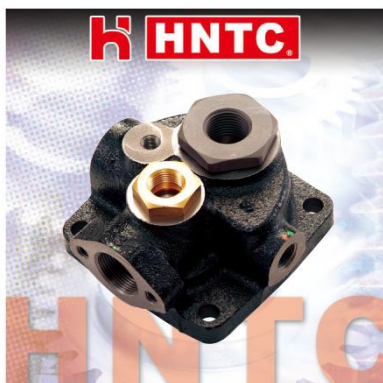
HEAD, AIR COMPRESSOR 空壓機汽缸蓋 H=60mm EM100 LEG*84 29110-1243