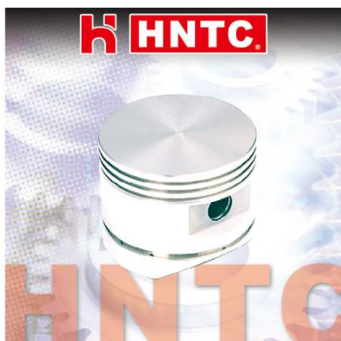
PISTON, AIR COMPRESSOR 空壓機活塞95m/m*4 CW520 CK450 RE8 14528-99015