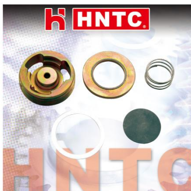
VALVE, IN A/C 進氣活門修理包 EXR330 10PC1 10PC1-IN KIT