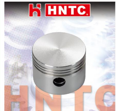
20. PISTON, A/C 空壓機活塞 70m/m*3 6BG1*86 6BD1*86 1-19161-008-0