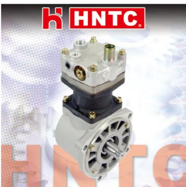
AIR COMPRESSOR A'SSY 空壓機總成P=85mm E13C-T LFR 390PS 29100-2960-H