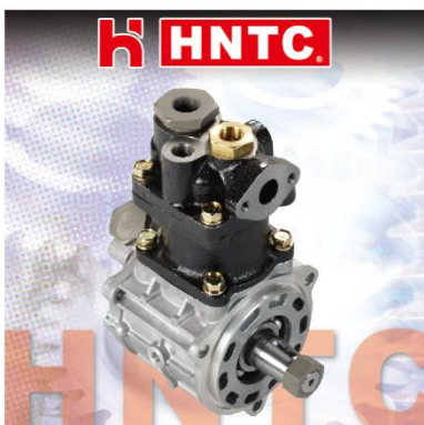
AIR COMPRESSOR ASSY 空壓機總成 70m/m TRUCK HO6CT(84-89) MFG*84 29100-1872