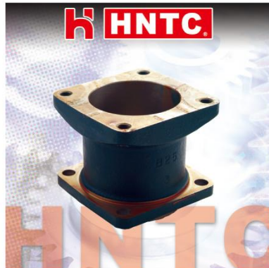
LINER, A/C 空壓機汽缸套 70mm 6BD1T*80 JCR*8.8T 1-19151-017-0