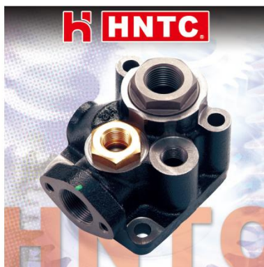
HEAD, AIR COMPRESSOR 空壓機汽缸蓋P70m/m(雙缸)鐵 P11C-TK*99 LSH2P*99 29110-1770