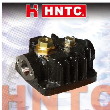
HEAD, AIR COMPRESSOR 空壓機汽缸蓋(鐵)(air cool) 6D14T 6D15 6D16 ME713148