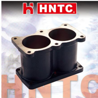
LINER, A/C 空壓機汽缸套 80mm J08C*20*雙缸 ERK240P 29165-1230