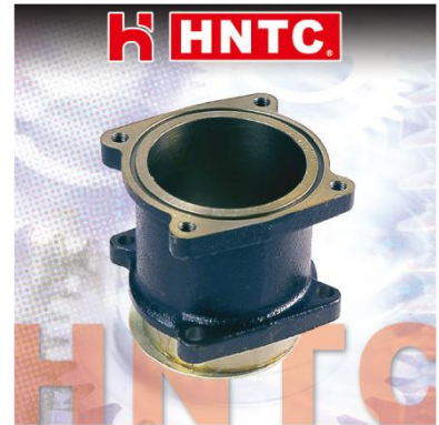
LINER, A/C 空壓機汽缸套85m/m SH EF750 29165-1120