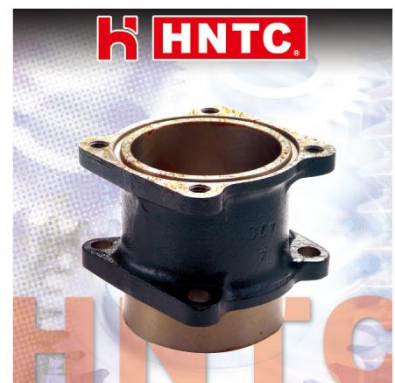
LINER, A/C 空壓機汽缸套 70mm P11C-TK H07C H06CT 29165-1130