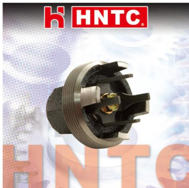
VALVE, UNLOADER 減壓活門 8DC2.4.8.90 ME260003