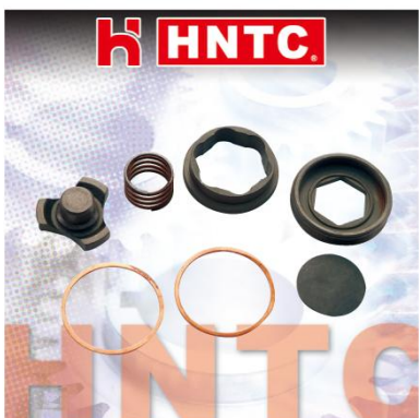
VALVE, EX A/C 排氣活門修理包 6RB1 6RB1-EX-KIT