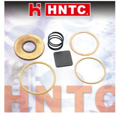
KIT, EX VALVE 排氣活門小修理包 J08C*20"*雙缸 ERK GH 29102-1361