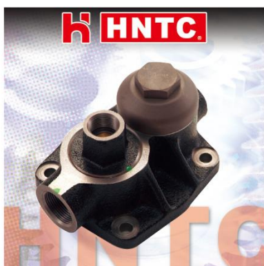
HEAD, AIR COMPRESSOR 空壓機汽缸蓋(P80).全 FV112 8DC2.4.8.90.T33 31275-72010