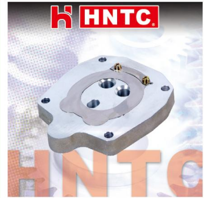
HEAD, AIR COMPRESSOR 空壓機汽缸蓋下 E13C-T 420PH 95mm 29120-1070-H