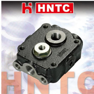
HEAD, AIR COMPRESSOR 空壓機汽缸蓋 6RB1 6QA1 6SA1 1-19110016-1