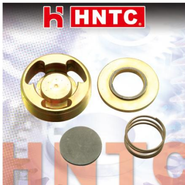
VALVE, IN A/C 進氣活門 P11C*20**雙缸 LSH*20 29101-1440