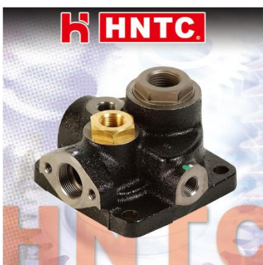
HEAD, AIR COMPRESSOR 空壓機汽缸蓋(單缸) 6D24T FV517JDL ME713414