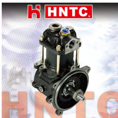
AIR COMPRESSOR ASSY 空壓機總成 85m/m FV419 FV415 FV413 FV515 ME091248 ME092472 ME091675