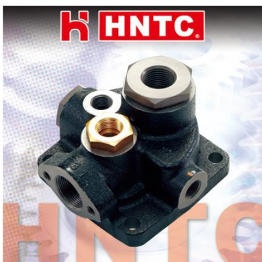
HEAD, AIR COMPRESSOR 空壓機汽缸蓋(單缸)出水孔14mm J08C*98 J05C*98 29110-1663