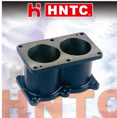
LINER, A/C 空壓機汽缸套 80m/m 6D22T MP518 30975-16500