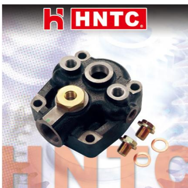
HEAD, AIR COMPRESSOR 空壓機汽缸蓋(鐵) 6HK/230(BUS) 1-19110056-1