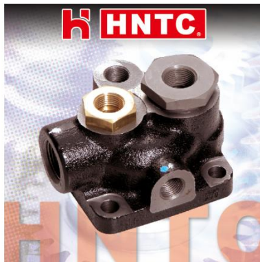
HEAD, AIR COMPRESSOR 空壓機汽缸蓋 EH700 RK FF GD 29110-1102