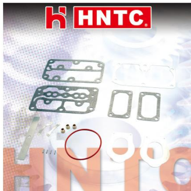
KIT, AIR COMPRESSOR 空壓機活門修理包 P113 320P 1327886 LP4815