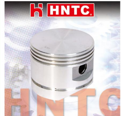
PISTON, AIR COMPRESSOR 空壓機活塞 95mm X 4Ring 6WF1-T 1-19161-023-0