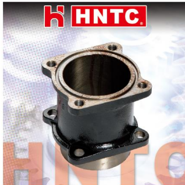
LINER, A/C 汽缸套(四方)70m/m 91 H07D H06CT H07CT 29165-1170