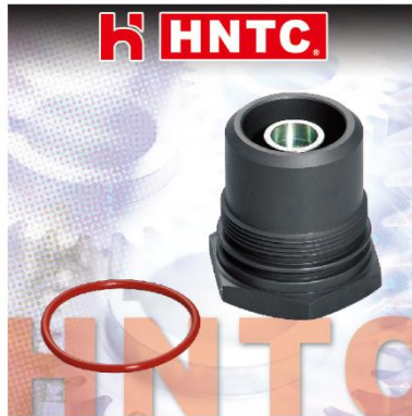
VALVE, EX A/C 排氣活門 EK100-84 EM100-84 29107-1010-S