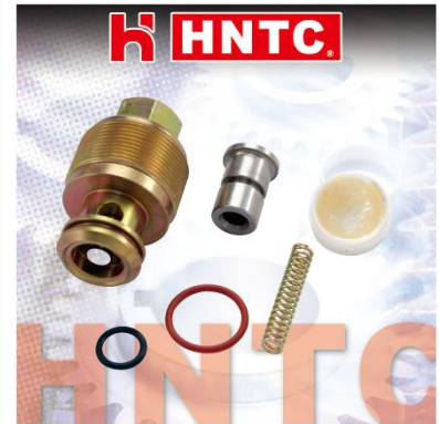
VALVE, UNLOADER 減壓活門修理包 K13C-TV 29103-1180