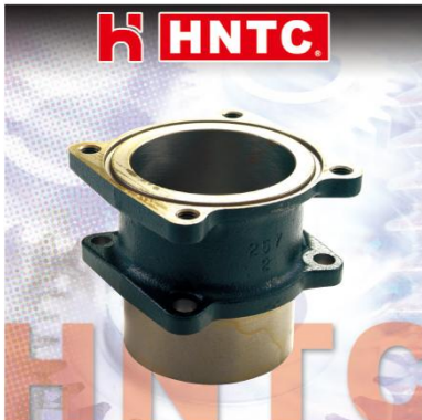
LINER, A/C 空壓機汽缸套 80mm L:102mm 6D14T 6D15 6D16 ME713146