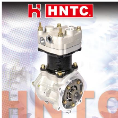
AIR COMPRESSOR A'SSY 空壓機(鋁蓋).P80.單缸.軸28mm JO8C-2003 29100-2910-H CRANK SHAFT D=28mm