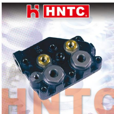
HEAD, AIR COMPRESSOR 空壓機汽缸蓋 6D22T 6D24T 30975-03060