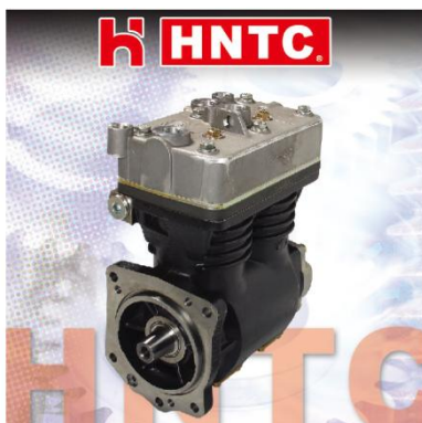
AIR COMPRESSOR ASSY 空壓機總成(電腦車) 88m/m K114 P114 SC340 1380457 LP4965 608/cm 2 13Bar