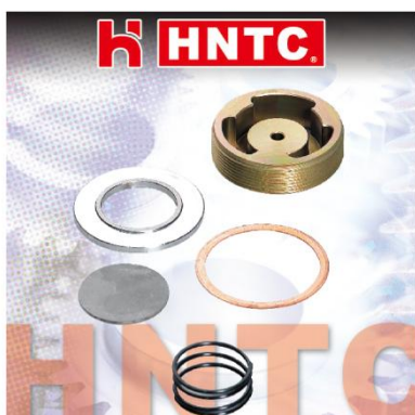
VALVE, IN A/C 進氣活門D52*H15 CW520 CK450 14570-99129