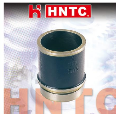
LINER, A/C 空壓機汽缸套 80m/m FP415 ME713111