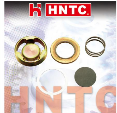
VALVE, IN A/C 進氣活門修理包 6RB1 6RB1-IN-KIT