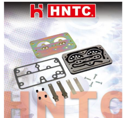
PLATE KIT, HEAD 空壓機中隔板 K114 P114 1376272-H