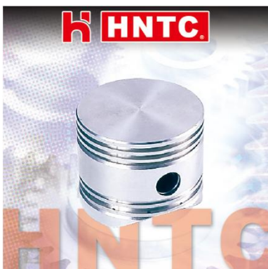
PISTON, AIR COMPRESSOR 空壓機活塞85m/m*4 FV415 FV419 6D20A ME713114 PISTON, AIR COMPRESSOR 空壓機活塞85m/m*4 EF750 F17C K13C 29191-1110