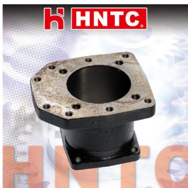
LINER, A/C 汽缸套90m/m 10PD1(340) 6RB1T*340 1-19151236-0