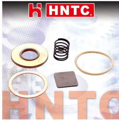
KIT, EX VALVE 排氣活門小修包 EH700 J08C J05C 29102-1300