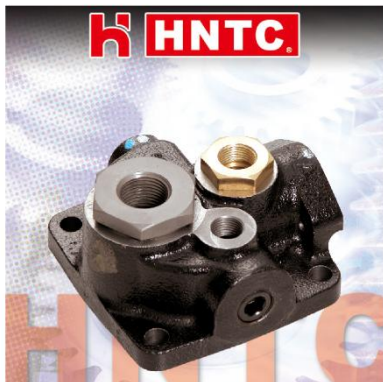
HEAD, AIR COMPRESSOR 空壓機汽缸蓋 EK100 EP100 LRK175 29110-1260