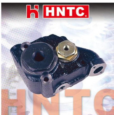
HEAD, AIR COMPRESSOR 空壓機汽缸蓋 F17C F20C 29110-1424