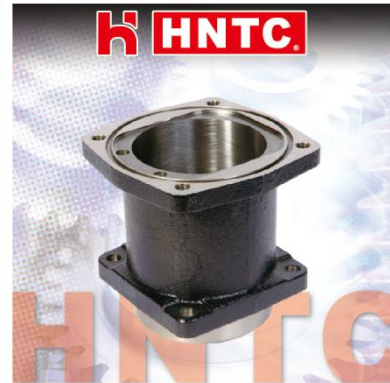
LINER A/C 空壓機汽缸套95mm 6WF1-T 1-19163-065-0