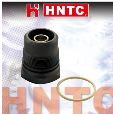
VALVE, EX A/C 排氣活門 H07CT*92 H07DT*92 29107-1170-S