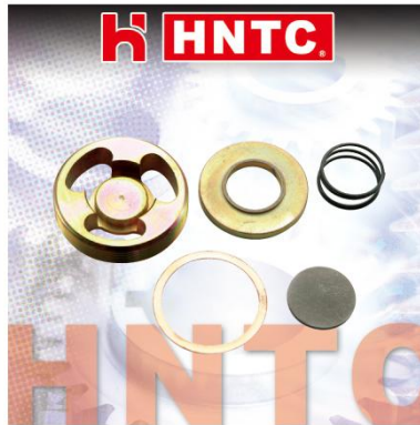
VALVE, IN A/C 進氣活門 JO8C*20**雙缸 ERK*240P 29101-1380