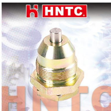
VALVE, UNLOADER 減壓活門 F20C F17C K13C 29103-1121 RD8 14550-99003