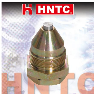
VALVE, UNLOADER 減壓活門 EF750 K13C 29103-1081