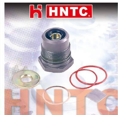
VALVE, EX A/C 排氣活門 F17C F20C K13C 29102-1270