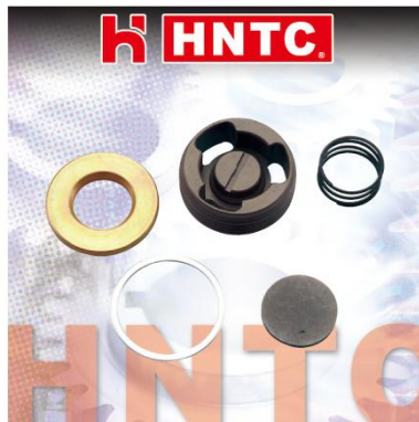
VALVE, IN A/C 進氣活門修理包 6BG1 6BG1-IN-KIT