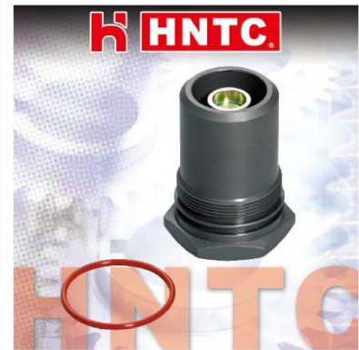
VALVE, EX A/C 排氣活門 EM100*96 JO8C單缸 29107-1240-S