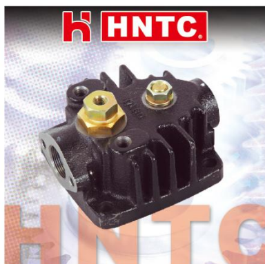
HEAD, AIR COMPRESSOR 空壓機汽缸蓋(air cool) MK117 6D16T 6D17A ME713164