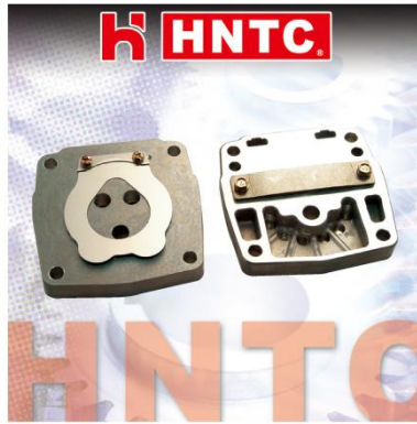
HEAD, AIR COMPRESSOR 空壓機汽缸蓋. 鋁. 下 K13C-TV*99 LSH1K*99 29120-1040 6M70 ME737220