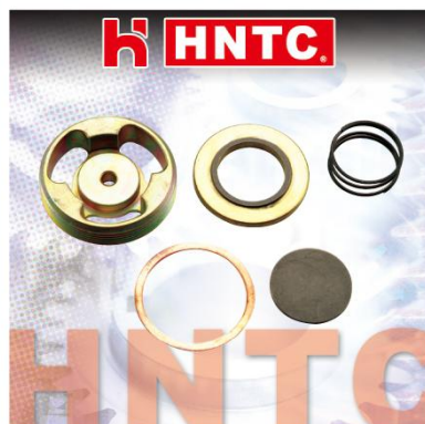
VALVE, IN A/C 進氣活門 CW54 RF8(340) 14570-99025