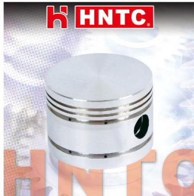
PISTON, AIR COMPRESSOR 空壓機活塞 70mm X 4Ring 6BG1 1-19161-021-0