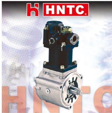
AIR COMPRESSOR ASSY 空壓機總成 K13C K13D 85mm 29100-1803