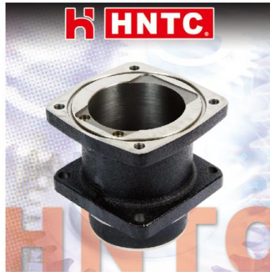
LINER, A/C 空壓機汽缸套 85m/m E13C-T 390PH 29165-1420