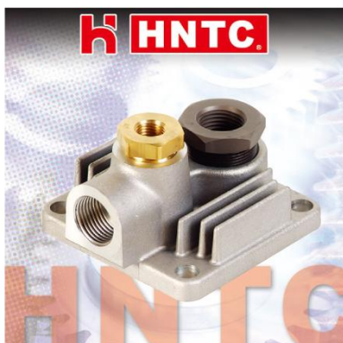
HEAD, AIR COMPRESSOR 空壓機汽缸蓋(鋁)(air cool) 6BD1 9-19110-024-0