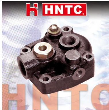
HEAD, AIR COMPRESSOR 空壓機汽缸蓋 EXR330 10PC1 1-19110018-1