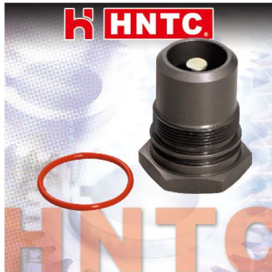
VALVE, EX A/C 排氣活門 EH700 H06C H07C 29107-1090-S