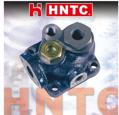
HEAD, AIR COMPRESSOR 空壓機汽缸蓋 HO6CT HO7CT H07D 70m/m 29110-1281