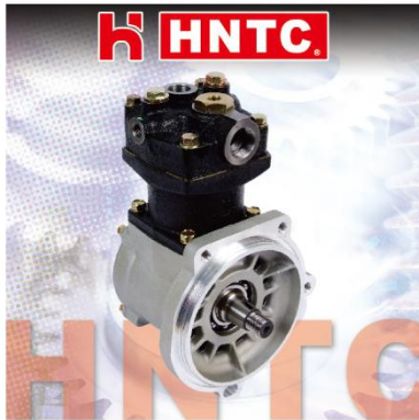
AIR COMPRESSOR A'SSY 空壓機總成P=85mm 6HE1 8-94394-039-3