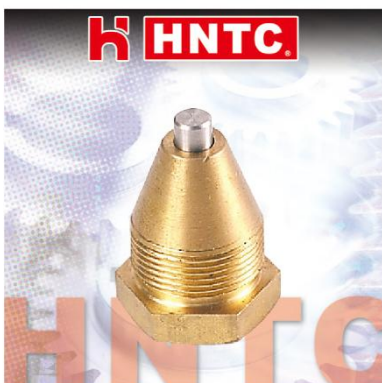
VALVE, UNLOADER 減壓活門 6D22T 6D16T 30975-03070 VALVE, UNLOADER 減壓活門 8DC91 6D22A EK100 ME713027