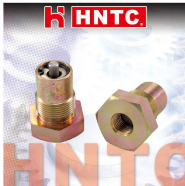
VALVE, UNLOADER 減壓活門 EXR320 6SA1 6RB1 6QB 1-19120002-0