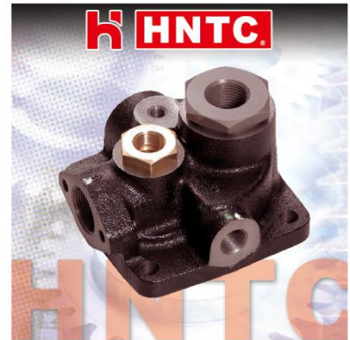
HEAD, AIR COMPRESSOR 空壓機汽缸蓋 EM100*94 LRK(200PS) 29110-1380