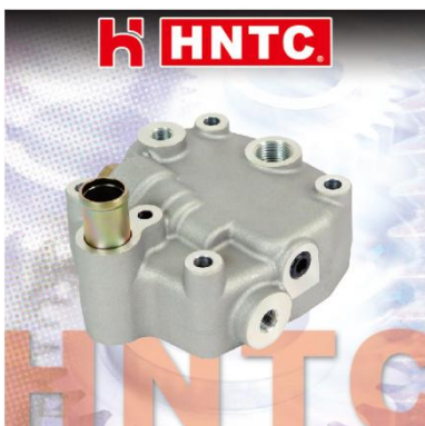
HEAD, AIR COMPRESSOR 空壓機汽缸蓋上 E13C-T 420PH 95mm 29110-1890-H