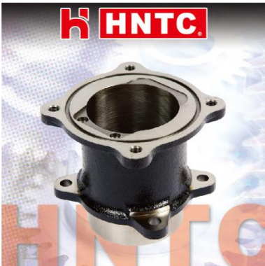
LINER, A/C 空壓機汽缸套 80m/m JO8C GH FG 29165-1360