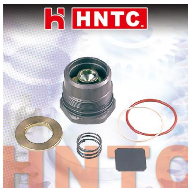
VALVE, EX A/C 排氣活門 EF750 29102-1160