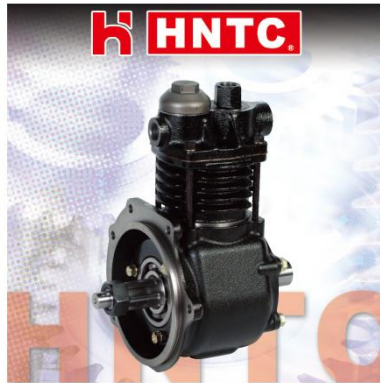
AIR COMPRESSOR A'SSY 空壓機總成AIR COOL 8DC2 8DC4 8DC80 81 8DC90 ME067023