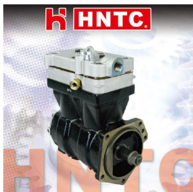
AIR COMPRESSOR ASSY 空壓機總成 85mm FM12 D12A D12C 412 704 008 0 20701801-H