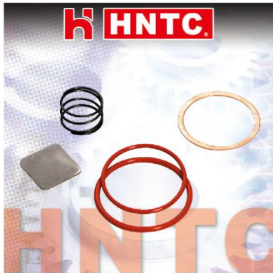
KIT, EX VALVE 排氣活門小修包D45.5*H 6D22T(雙缸) ME713069-KIT