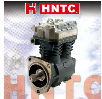
AIR COMPRESSOR ASSY 空壓機(雙缸).P=75m/m F10(310P) FL10(320) 8150407 LP4825 440/cm 2 12.50Bar