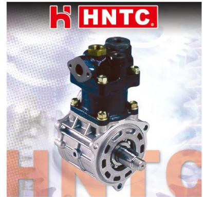
AIR COMPRESSOR ASSY 空壓機總成 HO6CT HO7CT 70m/m 29100-1961 Bus