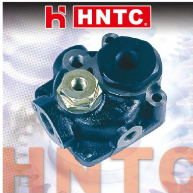
HEAD, AIR COMPRESSOR 空壓機汽缸蓋 SH MBS EF750 29110-1257