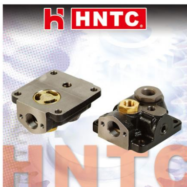
HEAD, AIR COMPRESSOR 空壓機汽缸蓋 (鐵) 6D16T ME713200