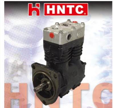
AIR COMPRESSOR ASSY 空壓機總成 75m/m P113 SC320 1303227 LP4815 440/cm 2 12.50Bar