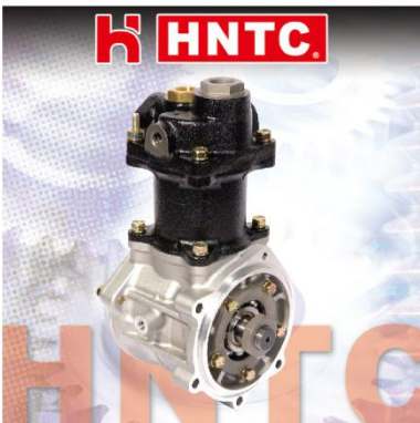
AIR COMPRESSOR A'SSY 空壓機總成(鐵蓋)P=80 JO8C-98 JO5C-98 29100-2323-H