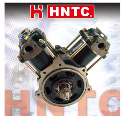
AIR COMPRESSOR ASSY 空壓機總成(雙缸)80m/m FP415 FP419 MS715 ME067899 ME092477 ME091680