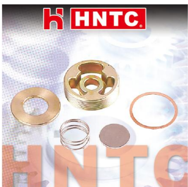
VALVE, IN A/C 進氣活門 6D15 6D16T 6D14T ME713161