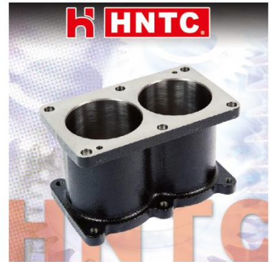
LINER, A/C 空壓機汽缸套 80m/m FP517 MP617 6D24T ME737034