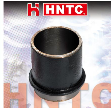
LINER, A/C 空壓機汽缸套(圓)85m/m 6D22A(單缸) 6D20A 30975-22100