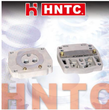
HEAD, AIR COMPRESSOR 空壓機汽缸蓋下6WF1-T 1-19110-064-0