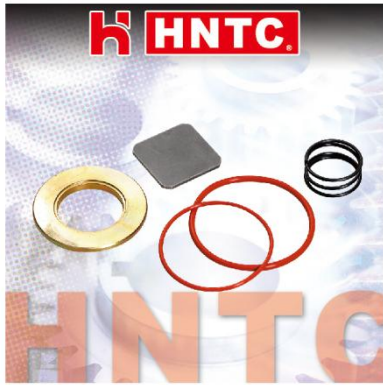
KIT, EX VALVE 排氣活門小修包 EF750 K13C F17C F20C 29102-1330