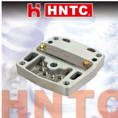
HEAD, AIR COMPRESSOR 空壓機汽缸蓋下 E13C-T 390PH 85mm 29120-1020-H P11C