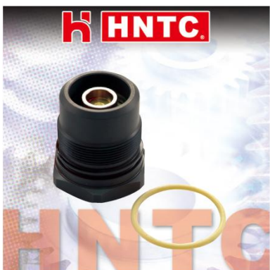
VALVE, EX A/C 排氣活門 J08C(雙缸) ERK(240P) 29107-1250