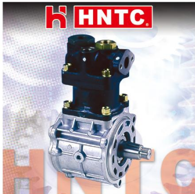
AIR COMPRESSOR ASSY 空壓機總成 EK100 80m/m 29100-2065