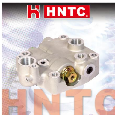
HEAD, AIR COMPRESSOR 空壓機汽缸蓋上 6WF1-T 1-19110-072-0