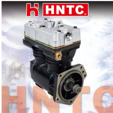
AIR COMPRESSOR ASSY 空壓機總成 88mm FH12 FH16 11001 1000 LP-4930 11101 1000 LP-4974 1628593-TT