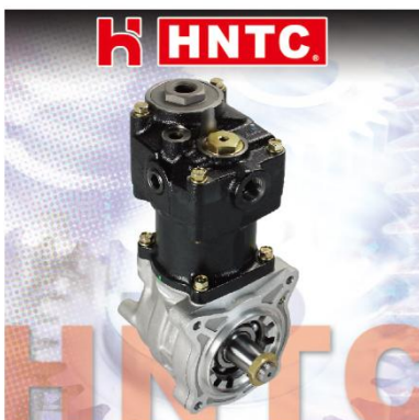
AIR COMPRESSOR ASSY 空壓機總成 95m/m CW520 CK450 RF8 14501-97101 PF6TC(380PS) 14501-97164