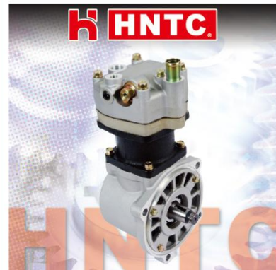
AIR COMPRESSOR A'SSY 空壓機總成P=95mm E13C-T 700 SERIES 420PS 29100-3060-H