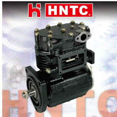
AIR COMPRESSOR ASSY 空壓機總成 75m/m P112/113 SC310 1300366 300162