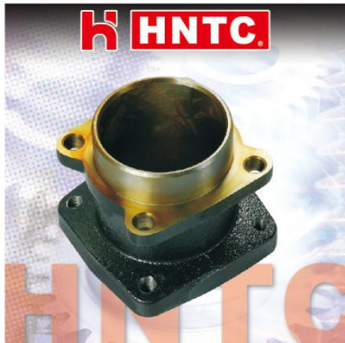
19.LINER, A/C 汽缸套(四方)80m/m HO7DT*93 HO6CT-L*93 29165-1210