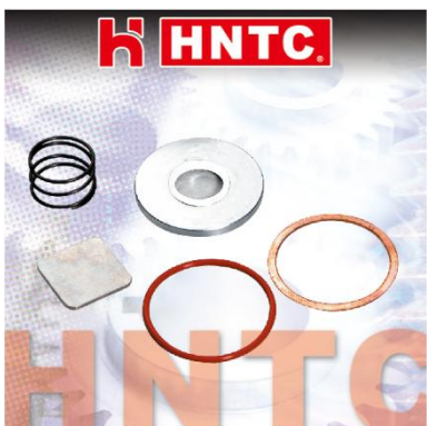
KIT, EX VALVE 排氣活門小修包 EK100 H06CT*92 EM100 29102-1040