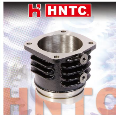
LINER, A/C 空壓機汽缸套80mm 8DC90. 80 31275-74501