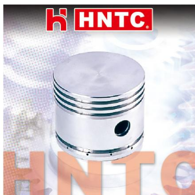
PISTON, AIR COMPRESSOR 空壓機活塞80m/m*4 8DC91 6D22T ME713110 PISTON, AIR COMPRESSOR 空壓機活塞80m/m*4 H07D H06CT J05C 29191-1150