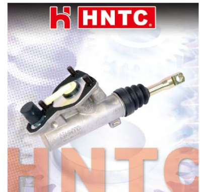
CLUTCH SERVO MASTER 離合器總泵 P380-08 R380-08 K380 1523400-H 1927829