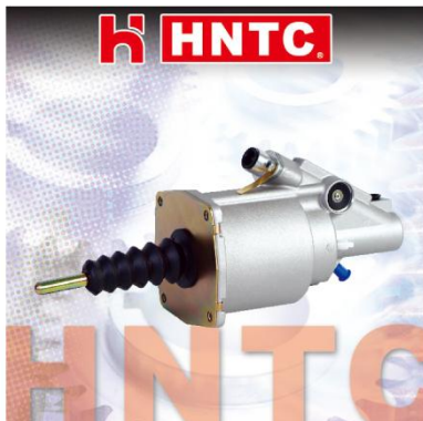
CLUTCH SERVO 離合器增壓泵 100mm ISUZU GIGA 1-31800-404-0 625559AM REPAIR KIT 6255960AM 1-31829-414-0