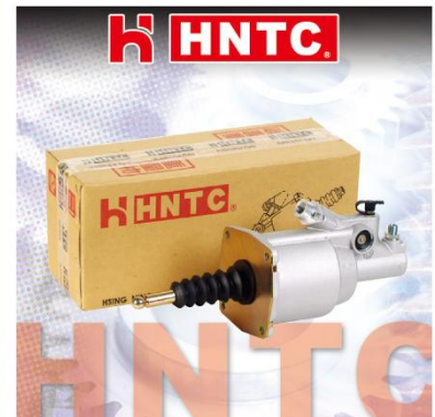
CLUTCH BOOSTER 離合器增壓泵 100mm FM12 VO rod=150mm 8171720 REPAIR KIT 85102142 628476AM