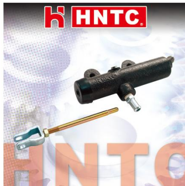
CLUTCH MASTER 1" 離合器總泵1"(斜頭) LSH-93 大將-93 ERK 31420-1610