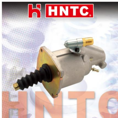
CLUTCH BOOSTER 離合器增壓泵 D=100mm P113 P112 371612 1331770 REPAIR KIT 550465 625282AM