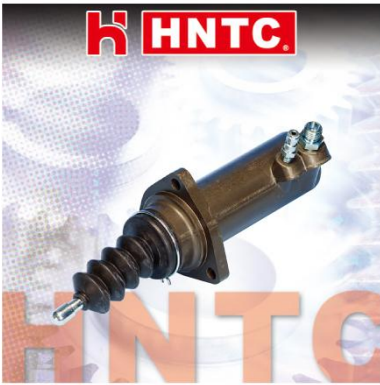
CLUTCH RELEASE CYLINDER 離合器分泵 P124 4 SERIES 3/8 PT 1754943