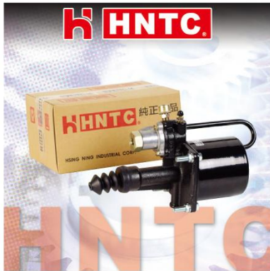
CLUTCH BOOSTER 105mm 離合器增壓泵 105*105mm ALL TRUCK P=22.2mm 642-09402 ALL TRUCK P=19.8mm 642-05130