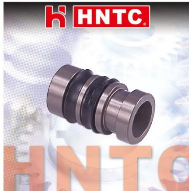
PISTON, C/B 增壓泵活塞 22.2m/m 642-11324 19.0m/m 642-14604