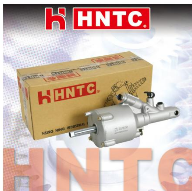
CLUTCH BOOSTER 離合器增壓泵 95mm FL10 F10 1671953 1521371 626639AM