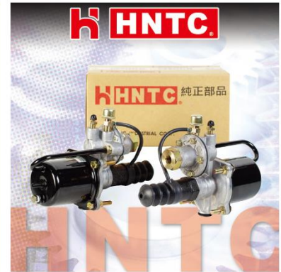
CLUTCH BOOSTER 離合器增壓泵 70mm ALL TRUCK P=22.2mm 642-09008 ALL TRUCK P=19.8mm 642-09003