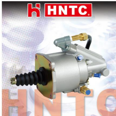
CLUTCH SERVO 離合器增壓泵 100mm SCANIA K113 1337966 624199AM REPAIR KIT 550465 625282AM