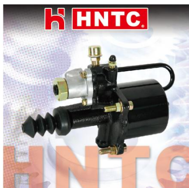
CLUTCH BOOSTER Casting Iron 離合器增壓泵 90mm ALL TRUCK P = 19.8mm M14 642-09307-H M14 ALL TRUCK P = 19.8mm 642-09302-H 3/8 PT ALL TRUCK P = 22.2mm 642-09305-H 3/8 PT ALL TRUCK P = 22.2mm 642-09306-H M14