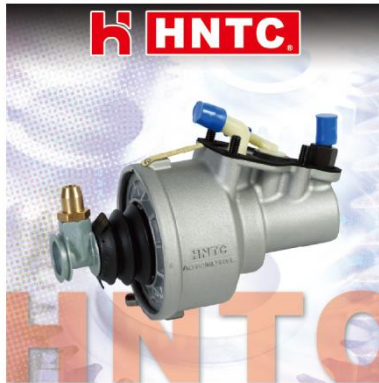
CLUTCH SERVO MASTER 離合器總泵 100mm SCANIA P114 P124 1513717 629683AM 1421186 REPAIR KIT 1484715 628131AM