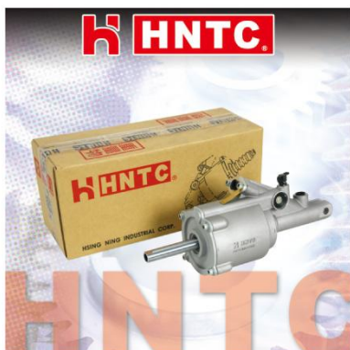
CLUTCH BOOSTER 離合器增壓泵 95mm FL10 F10 1668501-H 626639AM