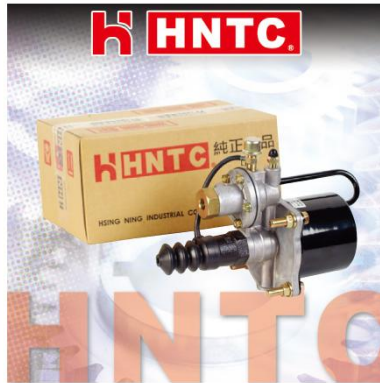
CLUTCH BOOSTER 離合器增壓泵 90mm ALL TRUCK P=22.2mm 642-09102 M14 ALL TRUCK P=22.2mm 642-09104 3/8 PT ALL TRUCK P=19.8mm 642-09105