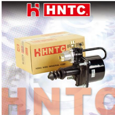
CLUTCH BOOSTER 離合器增壓泵 105*80mm ALL TRUCK P=22.2mm 642-09404 3/8 PT ALL TRUCK P=22.2mm 642-05221 M14 ALL TRUCK P=19.8mm 642-09406 642-05216 ME670256