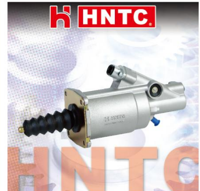
CLUTCH SERVO 離合器增壓泵 80mm DAF 1443521 628277AM REPAIR KIT 1443525 628304AM