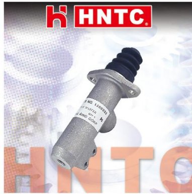
CYLINDER, CLUTCH 離合器總泵 SCANIA K113 1105332