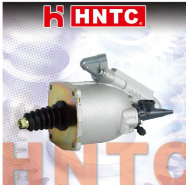
CLUTCH SERVO 離合器增壓泵 100mm RENAULT 5010545581 629300AM REPAIR KIT 5001849864 626736AM