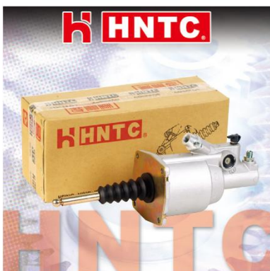
CLUTCH BOOSTER 離合器增壓泵 100mm FM12 VO rod=185mm 8171721 8171722