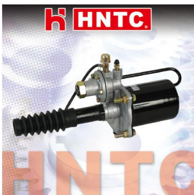
CLUTCH BOOSTER 離合器增壓泵 90*125mm ALL TRUCK P=22.2mm 642-03821-H