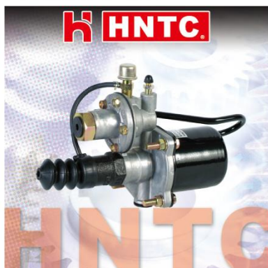
CLUTCH SERVO 離合器增壓泵 彎管70mm ISUZU 642-03179 P=22.2mm