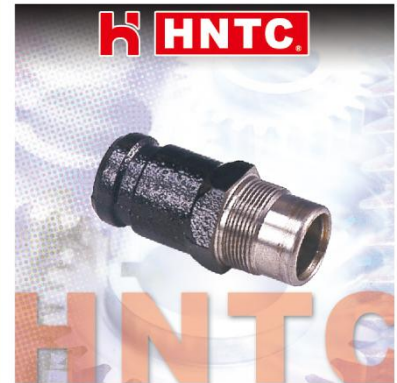
CYLINDER, C/B 增壓泵套管 22.2m/m 642-22406 19.0m/m 642-22425