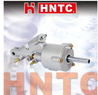
CLUTCH SERVO 離合器增壓泵 FL10 VO 80MM 1673067-H 626392AM REPAIR KIT 85102140 626703AM VO 3093098