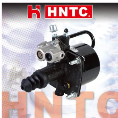
CLUTCH SERVO 離合器增壓泵 105*80mm HINO E13C SH1E 642-05454 P=22.2mm 32210-2180 FUSO 6M70 642-05278-M P=19.8mm 642-07117 ME524753