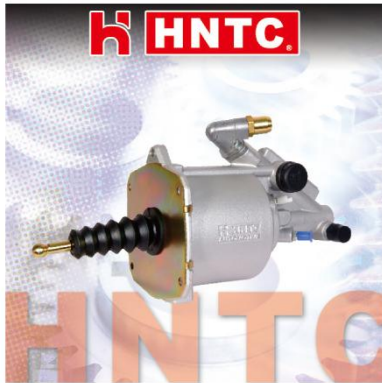
CLUTCH SERVO 離合器總泵 K380 P380 1523399 1784480 1927825