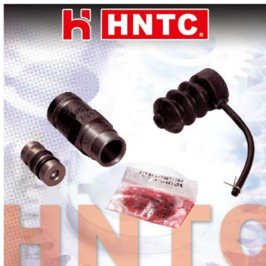
SET, C/B PISTON & CYL 離合器增壓泵套管/活塞 FP415 CW520 19.8 642-198 SET, C/B PISTON & CYL 離合器增壓泵套管/活塞 FV FV415 TD SH 22.2 642-222