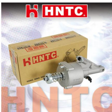
CLUTCH BOOSTER 離合器增壓泵 100mm P112 SC310 360717-H 622107AM