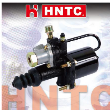
CLUTCH BOOSTER Casting Iron 離合器增壓泵 70mm ALL TRUCK P = 19.8mm 642-09205-H M14 ALL TRUCK P = 19.8mm 642-09203-H 3/8 PT ALL TRUCK P = 22.2mm 642-09206-H 3/8 PT ALL TRUCK P = 22.2mm 642-09204-H M14