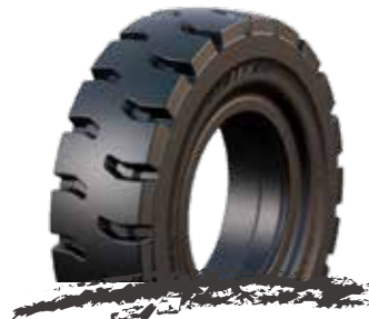
PATTERN 601 Click