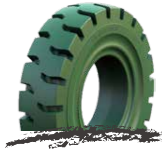
PATTERN 601 Non-marking